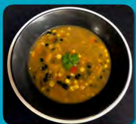
3 Sisters Stew